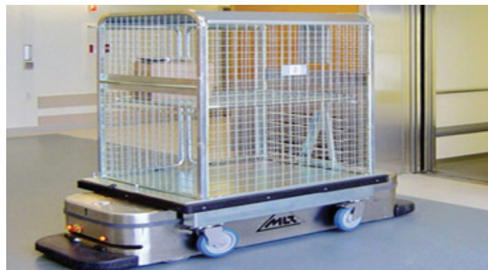
Sample Automated Guided Vehicle and supply cart.

Automated transportation is a new technology that Niagara Health will be introducing at the South Niag-