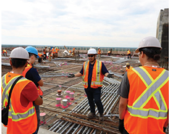
Indigenous youth from NPAAMB Indigenous Youth Employment & Training tour the South Niagara Hospital construction site with EllisDon staff on Aug. 19.

EllisDon and Niagara Health hosted youth and staff from NPAAMB Indigenous Youth Employment & Training at the construction site on Aug. 19. The group included high school students and young adults up to age 30 from across the Niagara region and as far as Hamilton, Brantford and Kitchener. NPAAMB offers training and employment programs that connect Indigenous youth with career pathways. The tours are designed to support that mission by introducing participants to high-demand trades and connecting them with professionals working in the field.