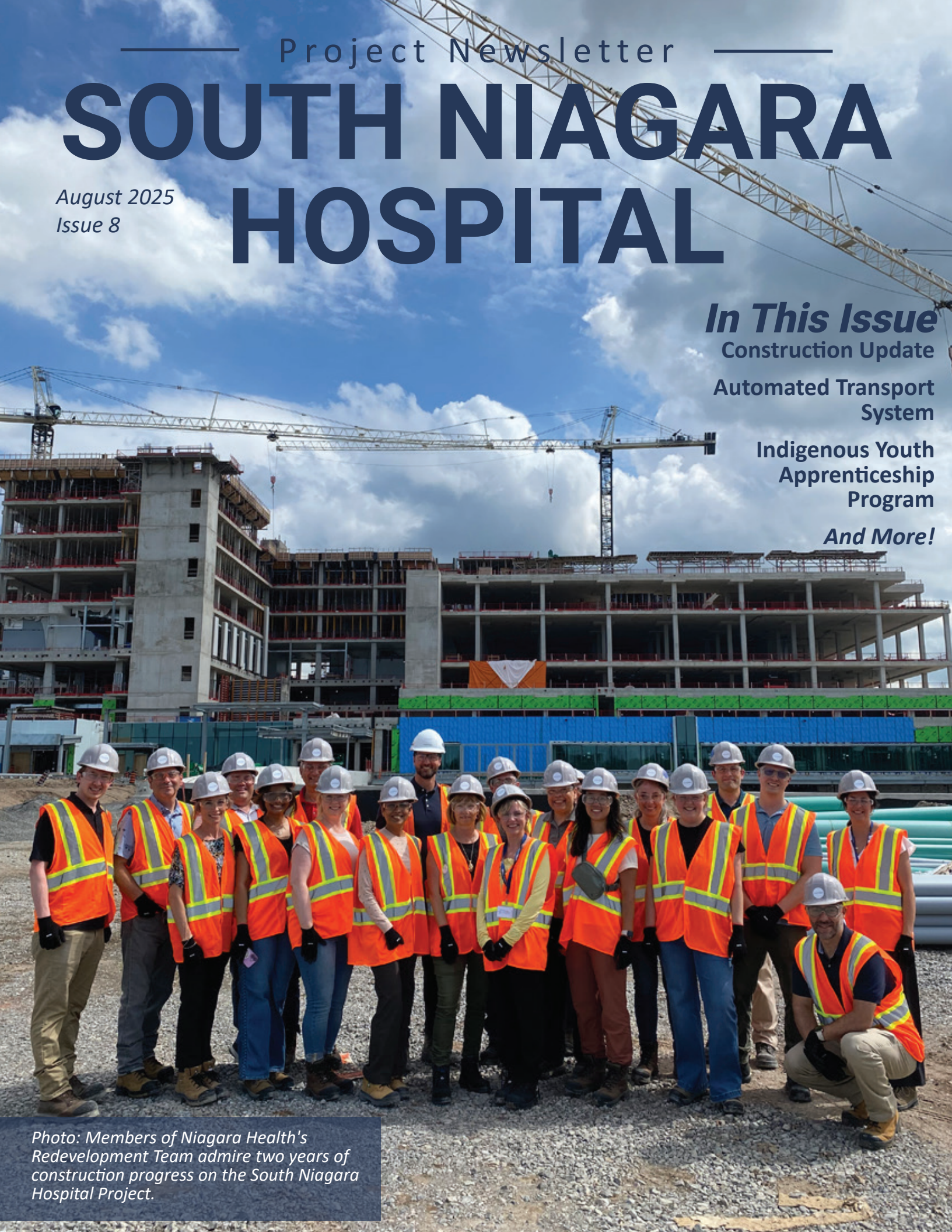
Photo: Members of Niagara Health's Redevelopment Team admire two years of construction progress on the South Niagara Hospital Project.