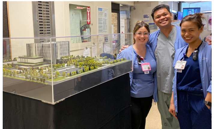
The SNH model is making its rounds to NH sites and community events, giving staff and the community an opportunity to see the model and ask questions about the new hospital.

During the early planning stages, NH consulted with staff, physicians, patients, families, Indigenous