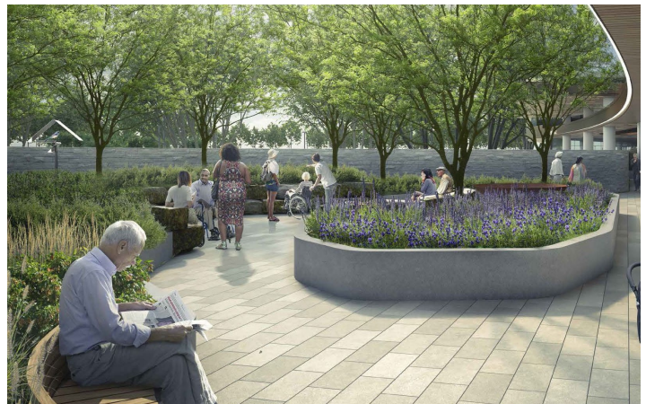
Indigenous Healing Garden

in the gardens. They may pass through the community plaza, which is a multi-purpose space that can host gatherings and community events, such as vendor markets, to encourage people to get outdoors and socialize. Each building entrance will have a unique garden, with plants and trees that are native to the area.