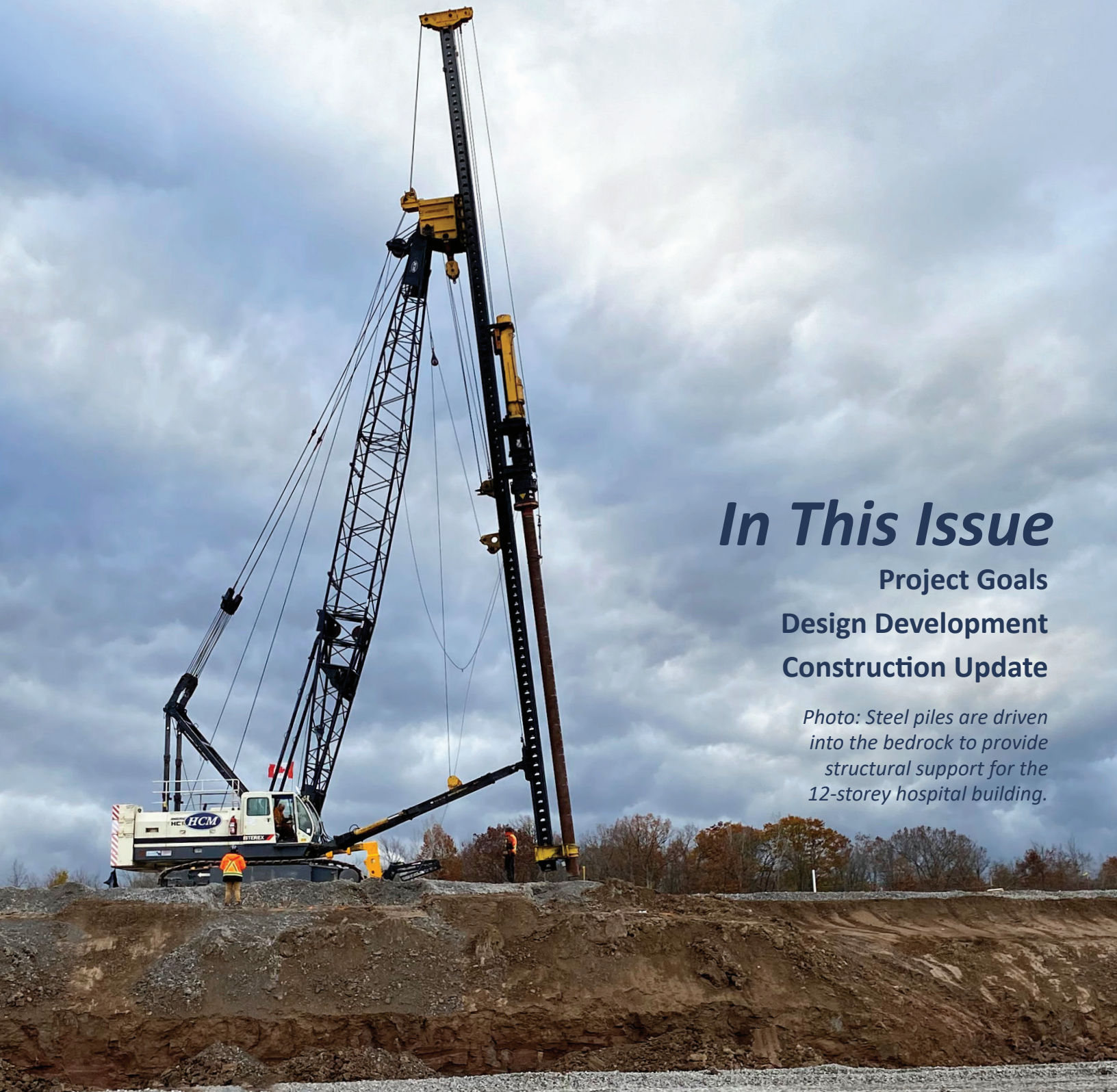
Photo: Steel piles are driven into the bedrock to provide structural support for the 12-storey hospital building.