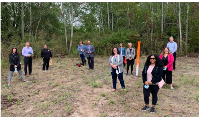
Indigenous Knowledge Keepers spoke to the land to explain the new purpose.

In consultation and partnership with Indigenous community members, Indigenous Knowledge Keepers spoke to the land to pay respect and explain the new purpose of the area, both its past and its future, connect with Mother Earth, and take time to recognize that the site will be a place of healing for many. Members from the Indigenous community were also invited to harvest materials from the thicket for their use.